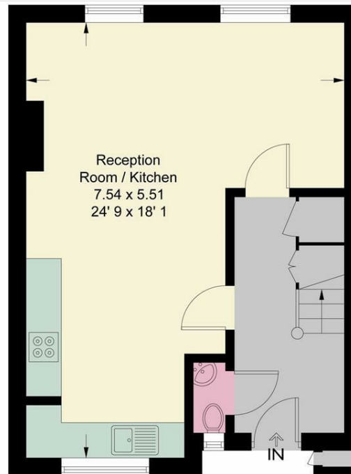
Ground Floor 436 sq ft / 40.5 sq m