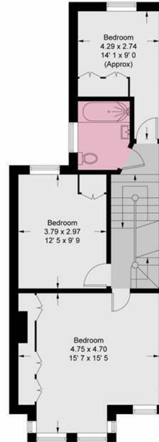
First Floor 582 sq ft / 54.1 sq m