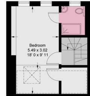
Second Floor 280 sq ft / 26 sq m (Including Reduced Headroom)