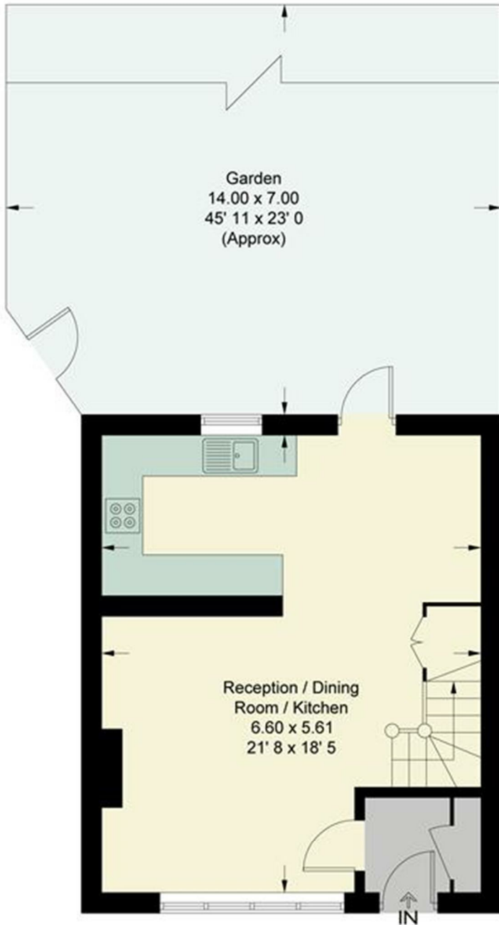
Ground Floor 402 sq ft / 37.4 sq m