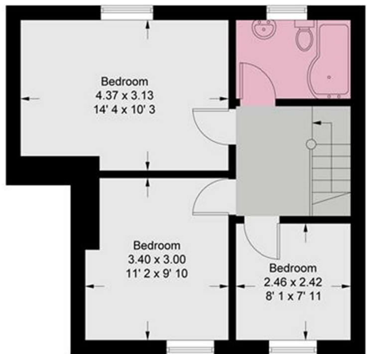
First Floor 446 sq ft / 41.4 sq m