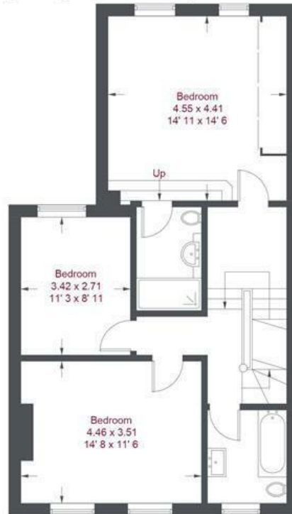
First Floor 755 sq ft / 70.2 sq m