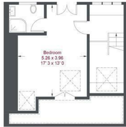
Second Floor 495 sq ft / 46 sq m (Including Reduced Headroom)