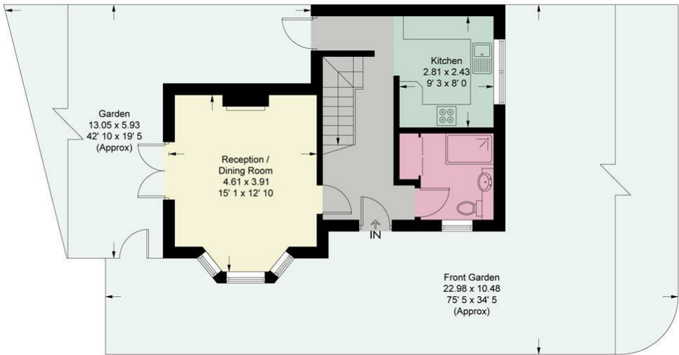
Ground Floor 434 sq ft / 40.3 sq m