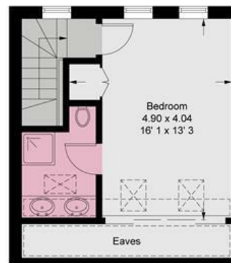
Second Floor 329 sq ft / 30.5 sq m (Including Reduced Headroom / Eaves)

This plan is not to scale and must be used as layout guidance only. All measurements and areas are approximate and should not be relied upon to provide accurate information. This plan must not be relied upon when making property valuations, design considerations or any other such relevant decisions. We accept no responsibility or liability (whether in contract, tort or otherwise) in relation to any loss whatsoever arising from or in connection with any use of this plan or the adequacy, accuracy or completeness of it or any information within it.