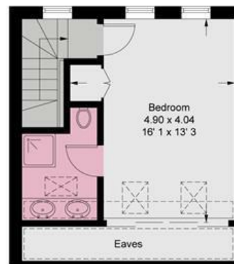
Second Floor 329 sq ft / 30.5 sq m (Including Reduced Headroom / Eaves)

This plan is not to scale and must be used as layout guidance only. All measurements and areas are approximate and should not be relied upon to provide accurate information. This plan must not be relied upon when making property valuations, design considerations or any other such relevant decisions. We accept no responsibility or liability (whether in contract, tort or otherwise) in relation to any loss whatsoever arising from or in connection with any use of this plan or the adequacy, accuracy or completeness of it or any information within it.