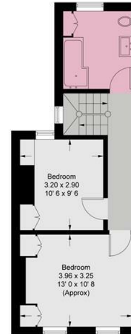
First Floor 400 sq ft / 37.2 sq m