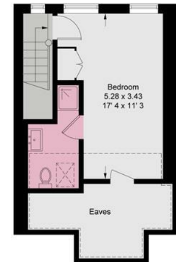
Second Floor 352 sq ft / 32.7 sq m (Including Reduced Headroom / Eaves)