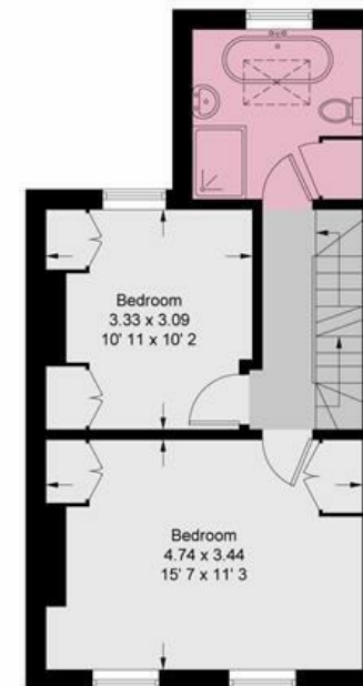
First Floor 427 sq ft / 39.7 sq m