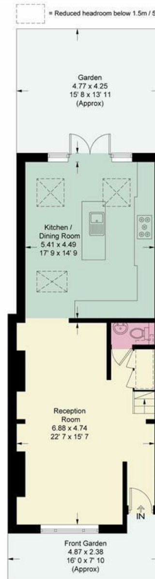
Ground Floor 612 sq ft / 56.9 sq m (Including Reduced Headroom)