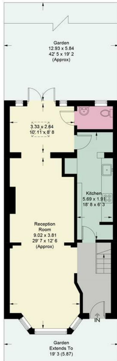
Ground Floor 668 sq ft / 62.1 sq m