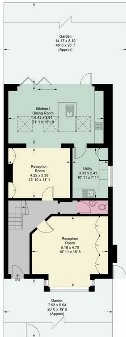
Ground Floor 932 sq ft / 86.6 sq m