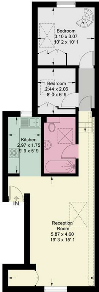
Second Floor 593 sq ft / 55.1 sq m (Including Reduced Headroom)