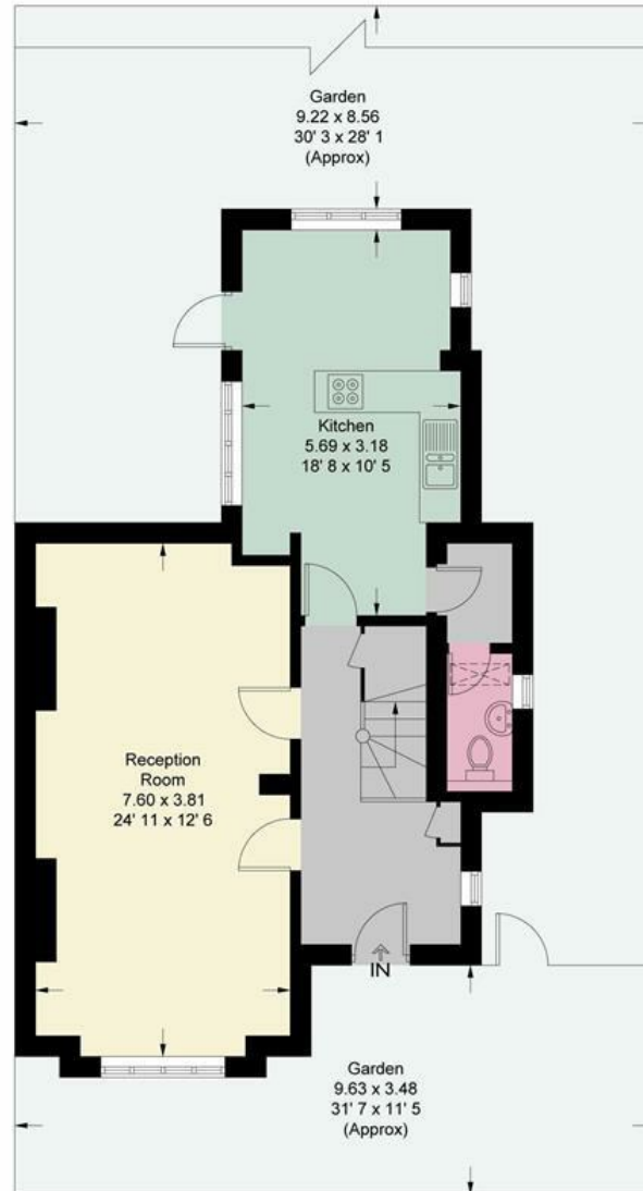
Ground Floor 653 sq ft / 60.7 sq m