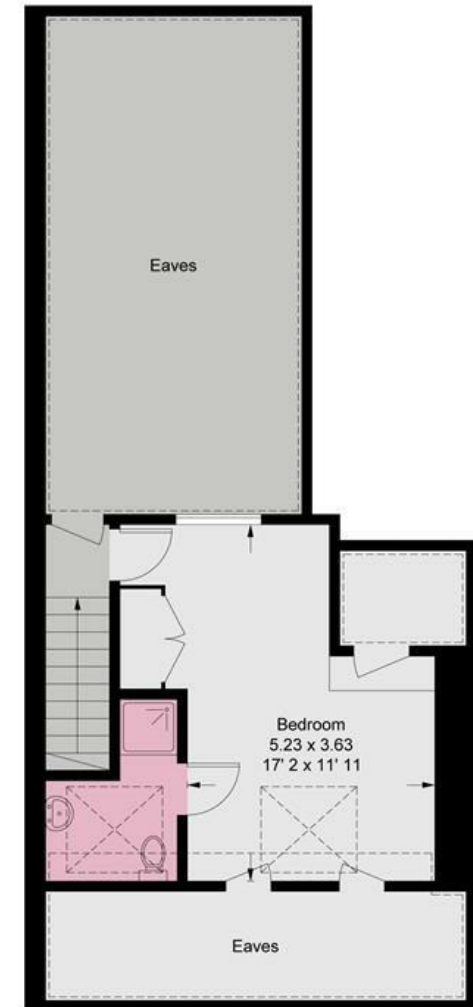
Second Floor 758 sq ft / 70.4 sq m (Including Reduced Headroom / Eaves)