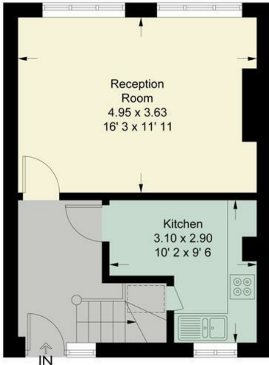
Ground Floor 365 sq ft / 33.9 sq m (Including Reduced Headroom)