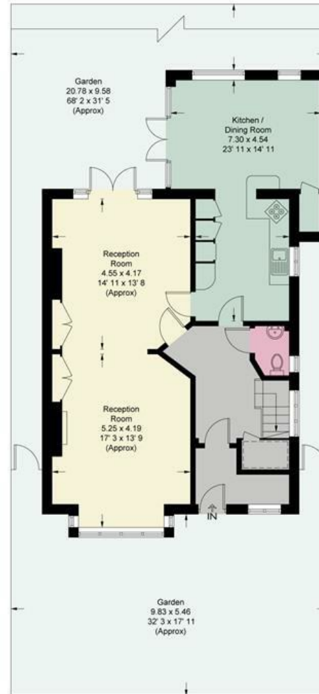
Ground Floor 927 sq ft / 86.1 sq m (Including Reduced Headroom)

This plan is not to scale and must be used as layout guidance only. All measurements and areas are approximate and should not be relied upon to provide accurate information. This plan must not be relied upon when making property valuations, design considerations or any other such relevant decisions. We accept no responsibility or liability (whether in contract, tort or otherwise) in relation to any loss whatsoever arising from or in connection with any use of this plan or the adequacy, accuracy or completeness of it or any information within it.