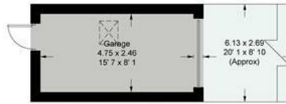
(Not Shown In Actual Location / Orientation)