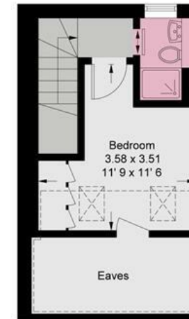
Second Floor 243 sq ft / 22.6 sq m (Including Reduced Headroom / Eaves)

This plan is not to scale and must be used as layout guidance only. All measurements and areas are approximate and should not be relied upon to provide accurate information. This plan must not be relied upon when making property valuations, design considerations or any other such relevant decisions. We accept no responsibility or liability (whether in contract, tort or otherwise) in relation to any loss whatsoever arising from or in connection with any use of this plan or the adequacy, accuracy or completeness of it or any information within it.