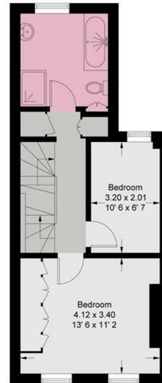
First Floor 408 sq ft / 37.9 sq m