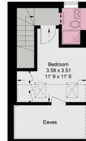
Second Floor 243 sq ft / 22.6 sq m (Including Reduced Headroom / Eaves)