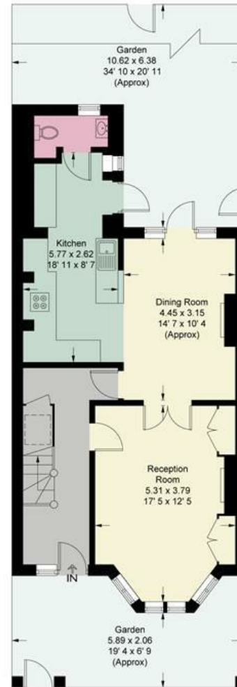
Ground Floor 674 sq ft / 62.6 sq m (Including Reduced Headroom)