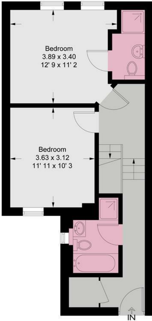
First Floor 489 sq ft / 45.4 sq m