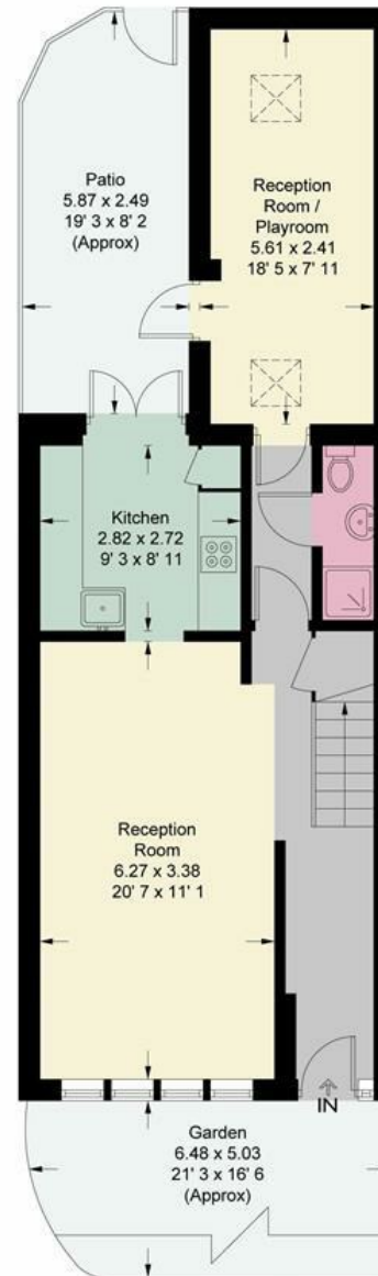
Ground Floor 623 sq ft / 57.9 sq m