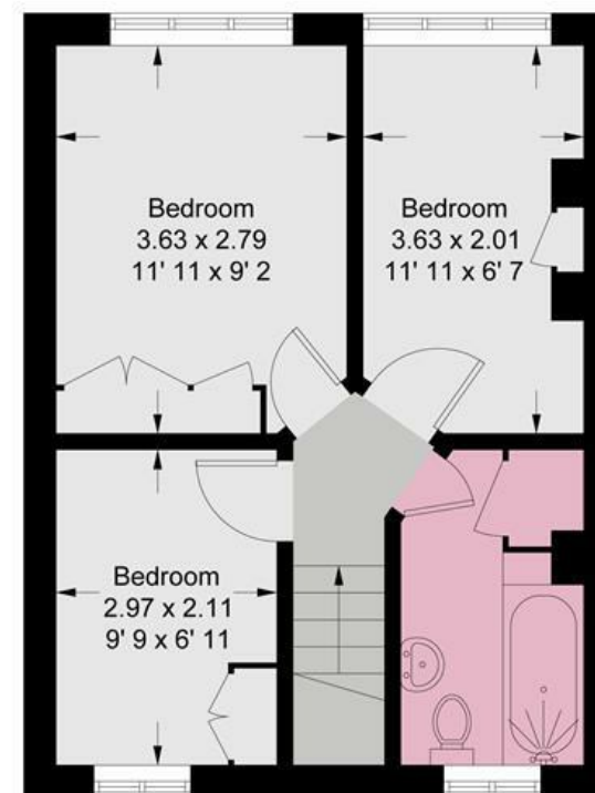
First Floor 363 sq ft / 33.7 sq m