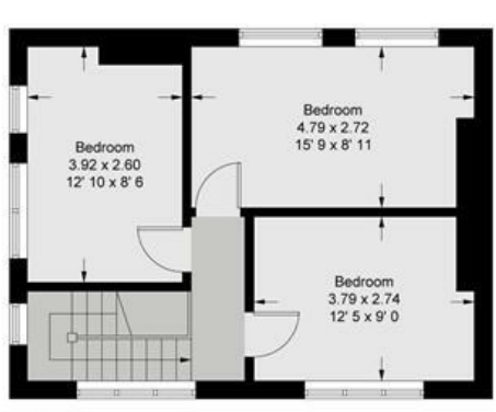
First Floor 452 sq ft / 42 sq m

This plan is not to scale and must be used as layout guidance only. All measurements and areas are approximate and should not be relied upon to provide accurate information. This plan must not be relied upon when making property valuations, design considerations or any other such relevant decisions. We accept no responsibility or liability (whether in contract, tort or otherwise) in relation to any loss whatsoever arising from or in connection with any use of this plan or the adequacy, accuracy or completeness of it or any information within it.