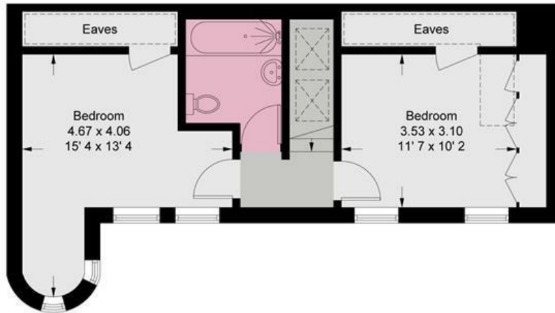
First Floor 440 sq ft / 40.9 sq m (Including Reduced Headroom / Eaves)