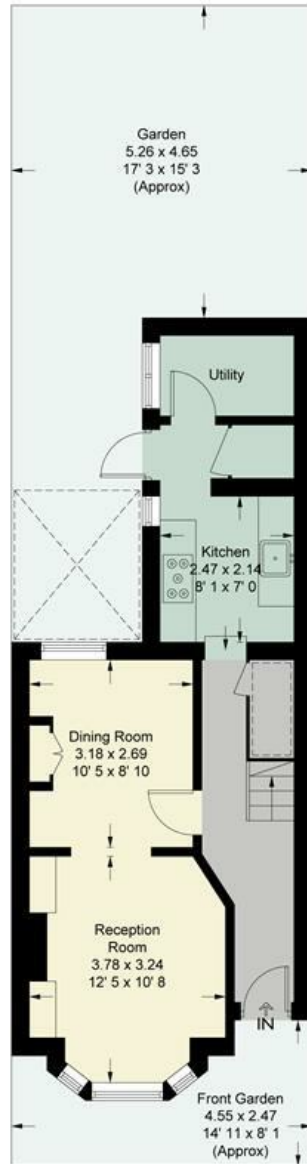
Ground Floor 447 sq ft / 41.5 sq m (Including Reduced Headroom)