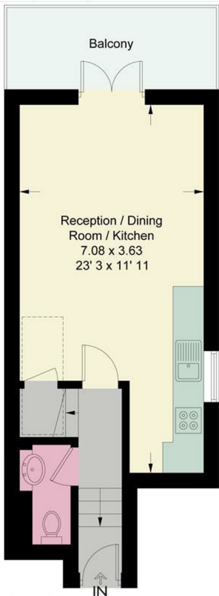
Ground Floor 318 sq ft / 29.5 sq m (Including Reduced Headroom)