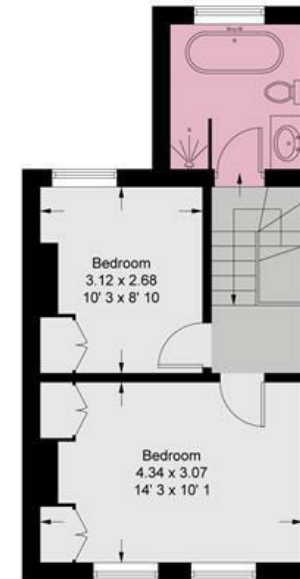
First Floor 370 sq ft / 34.4 sq m