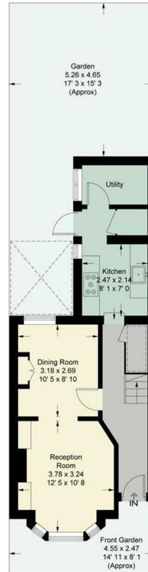
Ground Floor 447 sq ft / 41.5 sq m (Including Reduced Headroom)