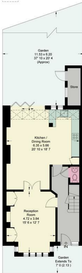
Ground Floor 653 sq ft / 60.7 sq m