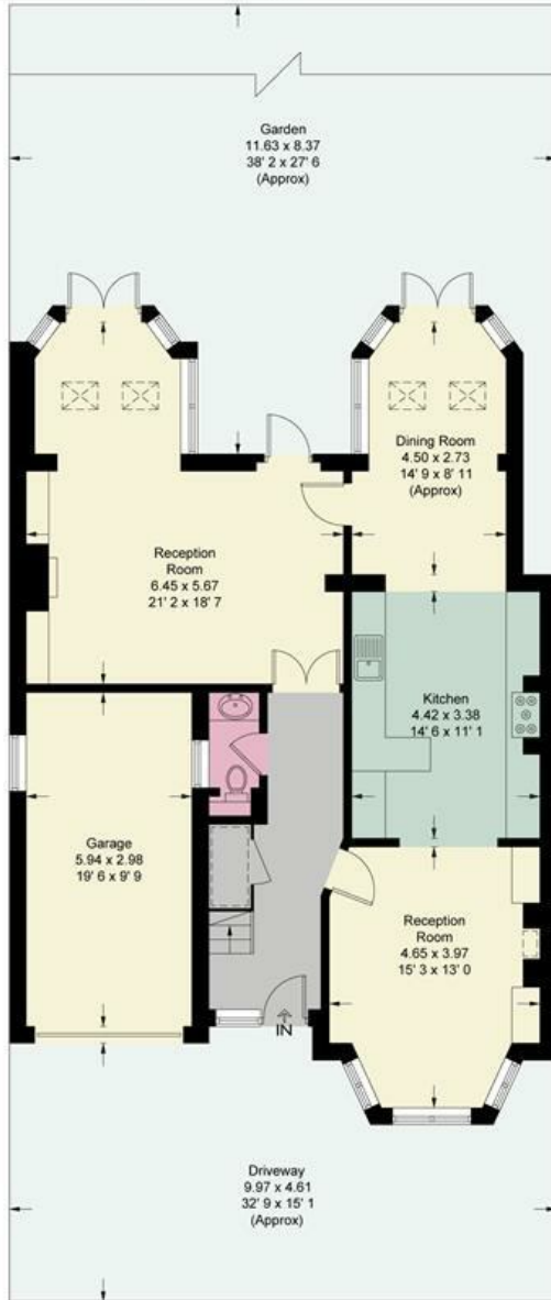
Ground Floor 926 sq ft / 86 sq m (Including Reduced Headroom / Excluding Garage)

Legend: [Dashed line] = Reduced headroom below 1.5m / 5'0"