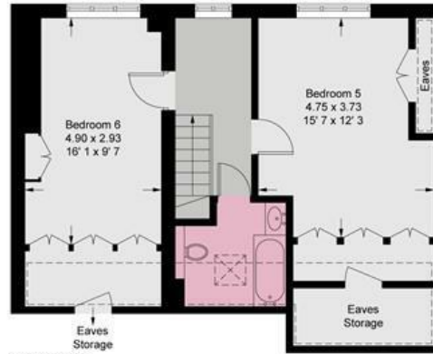
Second Floor 615 sq ft / 57.1 sq m (Including Reduced Headroom / Eaves Storage)

Legend: [Dashed box] = Reduced headroom below 1.5m / 5'0"