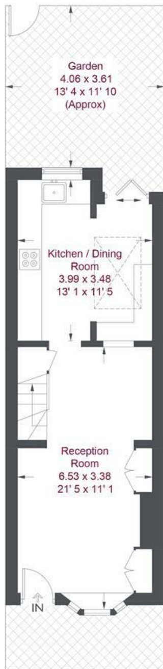
Ground Floor 370 sq ft / 34.4 sq m