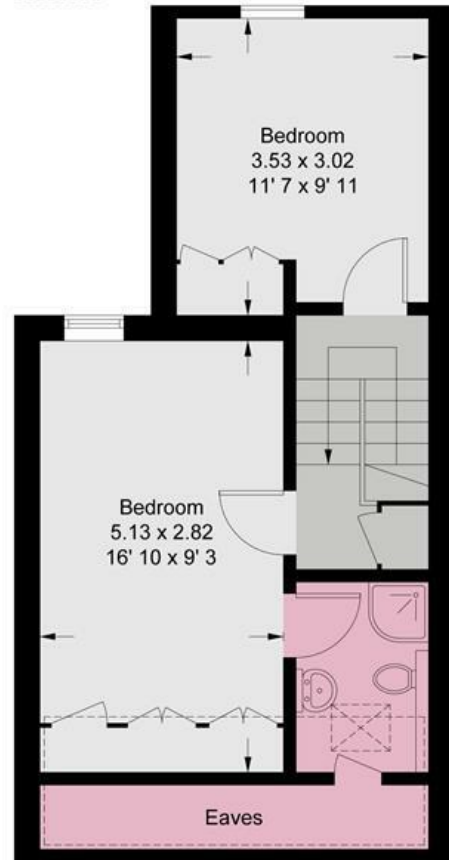
Second Floor 424 sq ft / 39.4 sq m (Including Reduced Headroom / Eaves)

This plan is not to scale and must be used as layout guidance only. All measurements and areas are approximate and should not be relied upon to provide accurate information. This plan must not be relied upon when making property valuations, design considerations or any other such relevant decisions. We accept no responsibility or liability (whether in contract, tort or otherwise) in relation to any loss whatsoever arising from or in connection with any use of this plan or the adequacy, accuracy or completeness of it or any information within it.