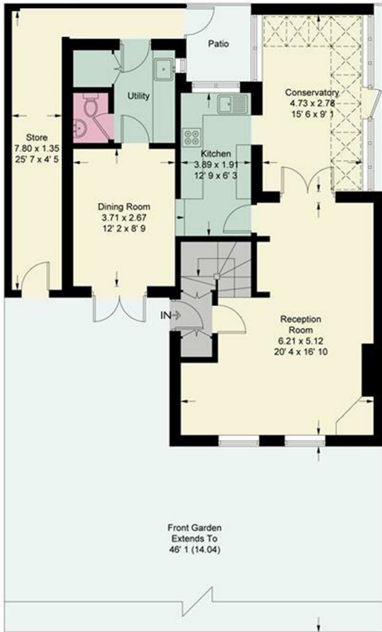
Ground Floor 770 sq ft / 71.5 sq m