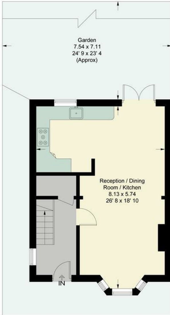
Ground Floor 487 sq ft / 45.2 sq m