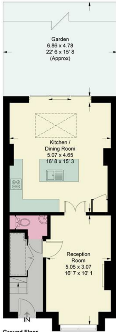
Ground Floor 506 sq ft / 47 sq m (Including Reduced Headroom)