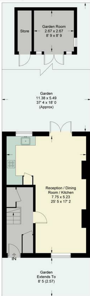
Ground Floor 446 sq ft / 41.4 sq m