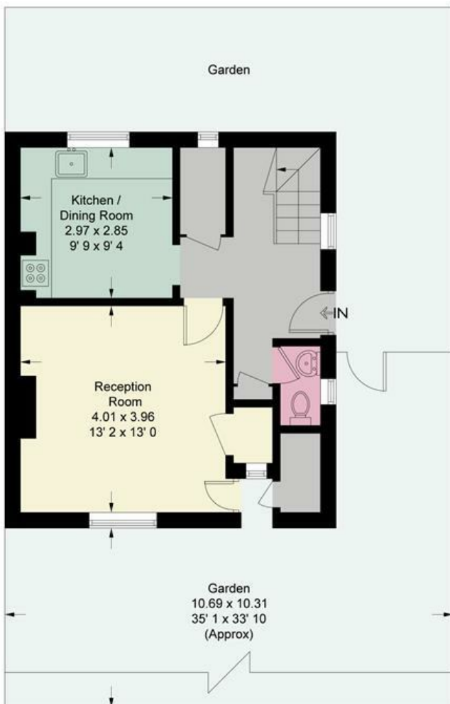
Ground Floor 426 sq ft / 39.6 sq m