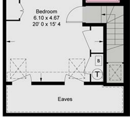
Second Floor 463 sq ft / 43 sq m (Including Reduced Headroom / Eaves)