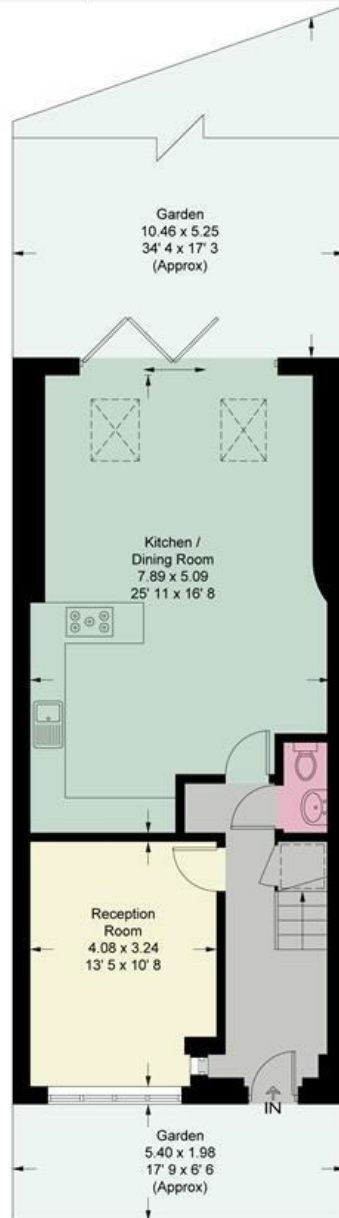
Ground Floor 657 sq ft / 61 sq m (Including Reduced Headroom)