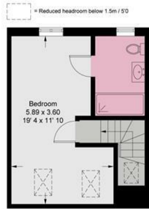
Second Floor 298 sq ft / 27.7 sq m