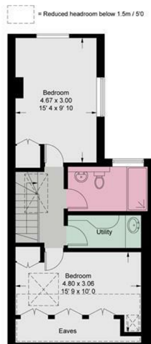
Second Floor 514 sq ft / 47.8 sq m (Including Reduced Headroom / Eaves)

This plan is not to scale and must be used as layout guidance only. All measurements and areas are approximate and should not be relied upon to provide accurate information. This plan must not be relied upon when making property valuations, design considerations or any other such relevant decisions. We accept no responsibility or liability (whether in contract, tort or otherwise) in relation to any loss whatsoever arising from or in connection with any use of this plan or the adequacy, accuracy or completeness of it or any information within it.