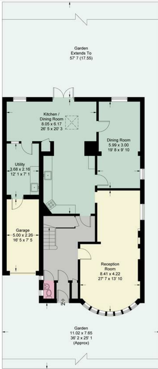
Ground Floor 1356 sq ft / 126 sq m (Including Garage)