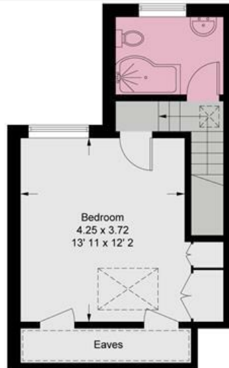
Second Floor 330 sq ft / 30.7 sq m (Including Reduced Headroom / Eaves)