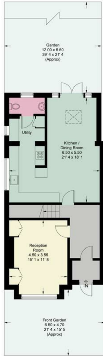
Ground Floor 706 sq ft / 65.6 sq m