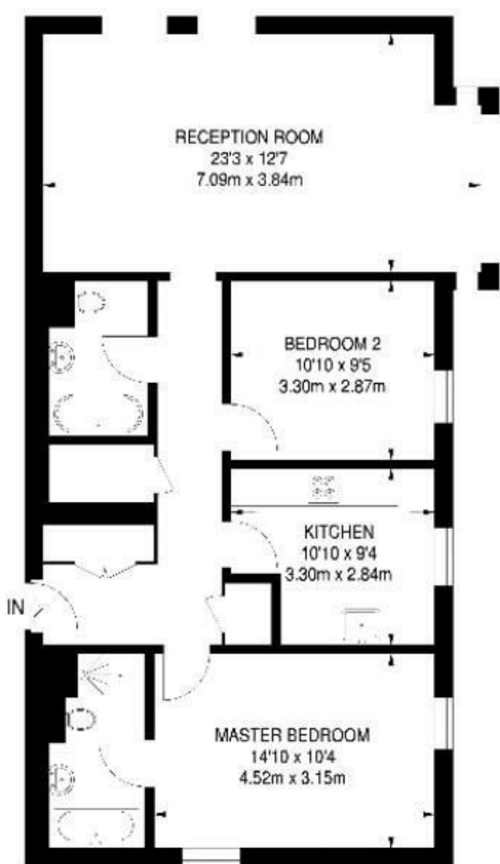
FIRST FLOOR 926 SQ FT / 86.0 SQ M