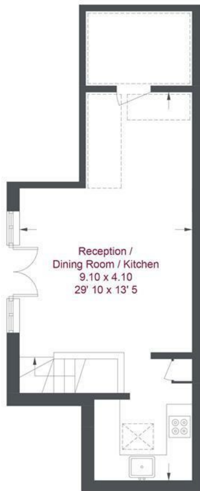
Second Floor 386 sq ft / 35.9 sq m (Including Reduced Headroom)