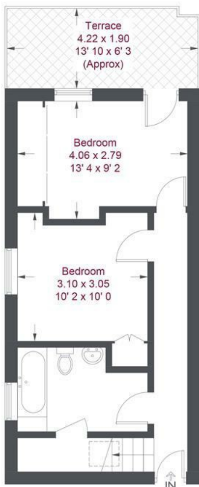
First Floor 399 sq ft / 37.1 sq m (Including Reduced Headroom)