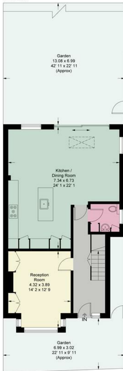
Ground Floor 786 sq ft / 73 sq m