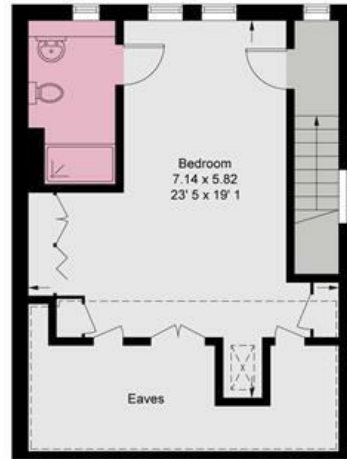
Second Floor 515 sq ft / 47.9 sq m (Including Reduced Headroom / Eaves)