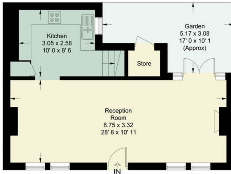
Ground Floor 472 sq ft / 43.9 sq m

This plan is not to scale and must be used as layout guidance only. All measurements and areas are approximate and should not be relied upon to provide accurate information. This plan must not be relied upon when making property valuations, design considerations or any other such relevant decisions. We accept no responsibility or liability (whether in contract, tort or otherwise) in relation to any loss whatsoever arising from or in connection with any use of this plan or the adequacy, accuracy or completeness of it or any information within it.