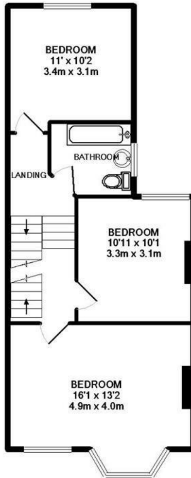
FIRST FLOOR APPROX. FLOOR AREA 50.3 SQ.M. (541 SQ.FT.)