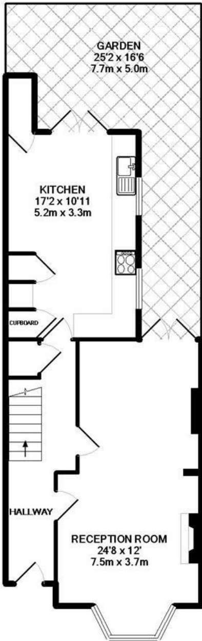
GROUND FLOOR APPROX. FLOOR AREA 51.5 SQ.M. (555 SQ.FT.)