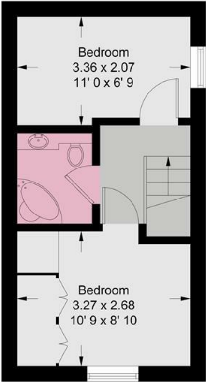
First Floor 243 sq ft / 22.6 sq m